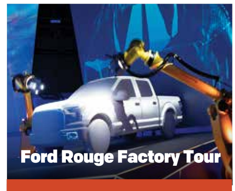
Ford Rouge Factory Tour

All-Day Model T and Steam Locomotive Tours of Greenfield Village, Plus Antique Carousel