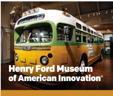
Henry Ford Museum of American Innovation®